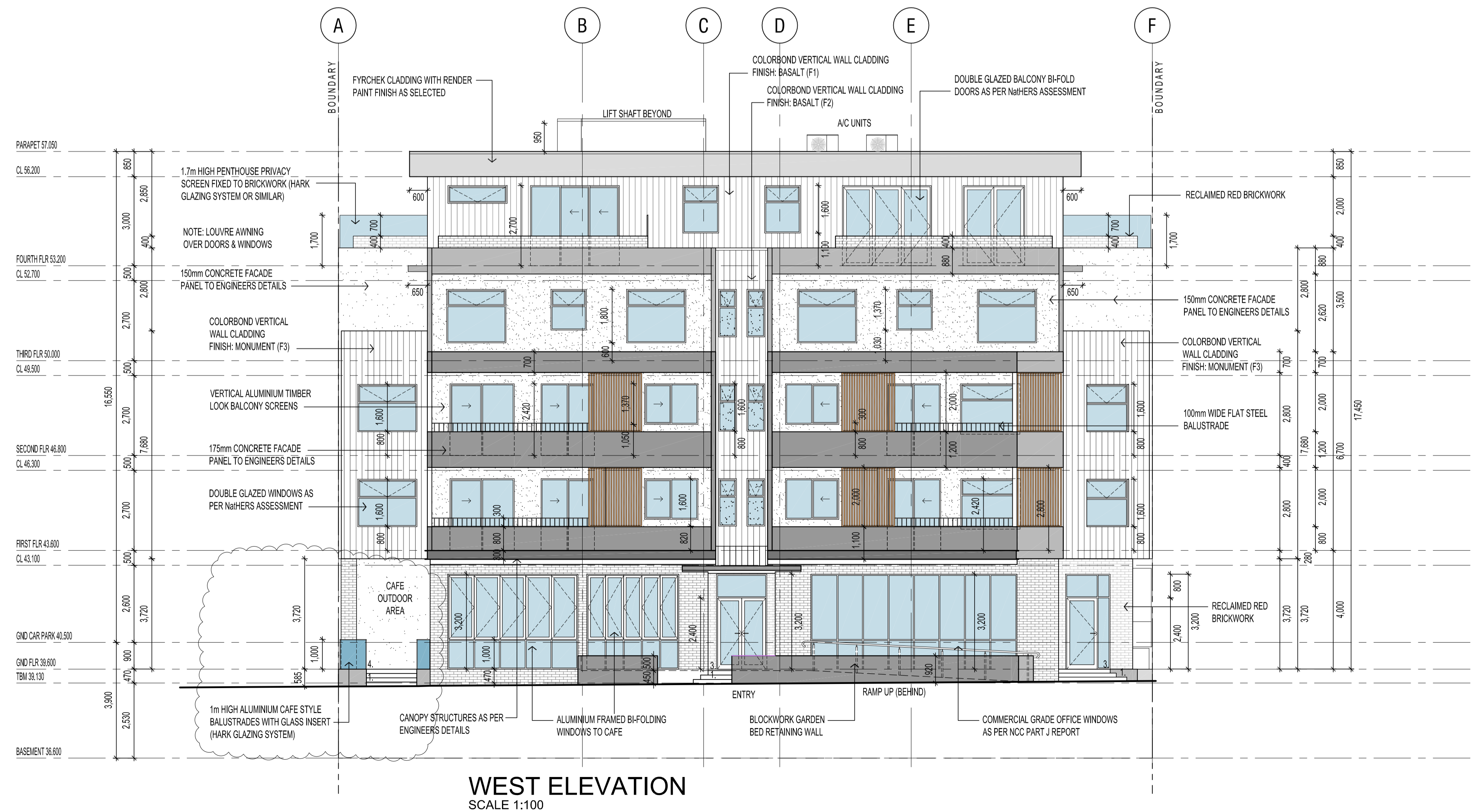
WEST ELEVATION SCALE 1:100